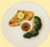
GRILLED DORI FISH

Grilled Chicken Breast served with Sauteed Broccoli & Mushroom Sauce