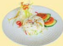
NASI GORENG SAYUR VEGAN 45.5K/Nett