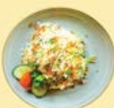
BIHUN GORENG VEGAN 42.5K/Nett

Stir - Fried Rice Noodle with Mixed Vegetable