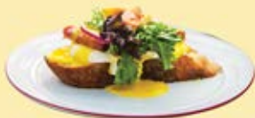
EGG BENEDICT 55K/Nett