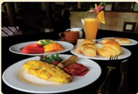
AMERICAN STYLE 75K/Nett

1 Cup Hot Coffee 1 Pastry (From Our Selection)