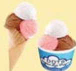
VEGAN ICE CREAM