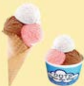
VEGAN ICE CREAM 15K/Scoop

Choice of taste: Coconut, Avocado, Chocolate, Strawberry, Mocha, Vanilla