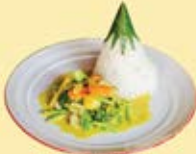
VEGAN VEGETABLE CURRY 45.5K/Nett

Stir - Fried Rice Noodle with Mixed Vegetable