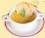
VEGAN CORN SOUP 40.5K/Nett

Mixed blanched Vegetable with Bean Curd, Bean Cake and Peanut Sauce