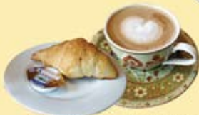
LITE BREAKFAST 35K/Nett

1 Cup Hot Coffee 1 Pastry (From Our Selection)