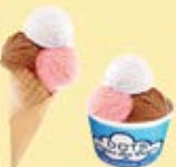
VEGAN ICE CREAM