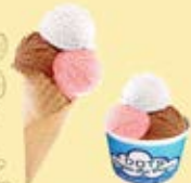
VEGAN ICE CREAM 15K/Scoop

Choice of taste: Cocoquat, Avocado, Blueberry, Strawberry, Mocha, Vanilla