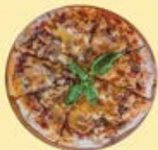
MEAT LOVERS PIZZA